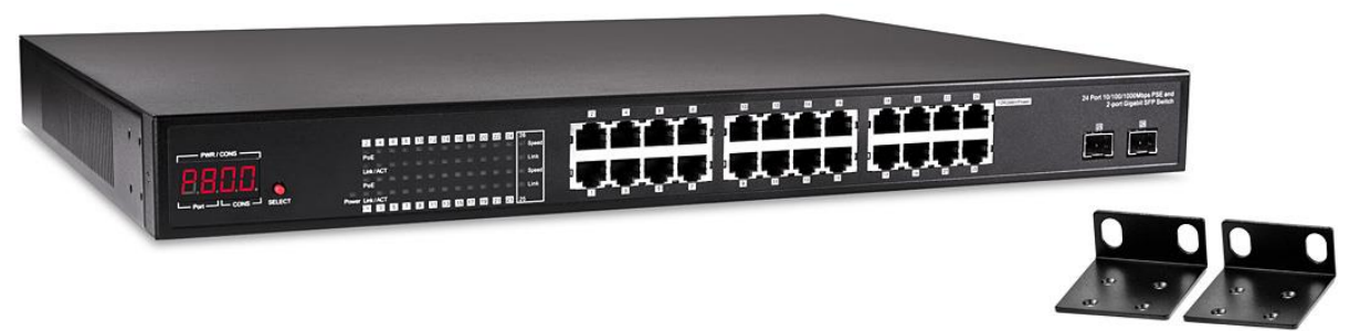
Rackmount Ears Included

The VS-SW-100 is a 26-port 10/100/1000Mbps Power over Ethernet switch which consists of 24 PSE/PoE ports with an additional 2 SFP uplink port.